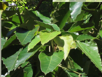
盾狀葉 shield-shaped leaves